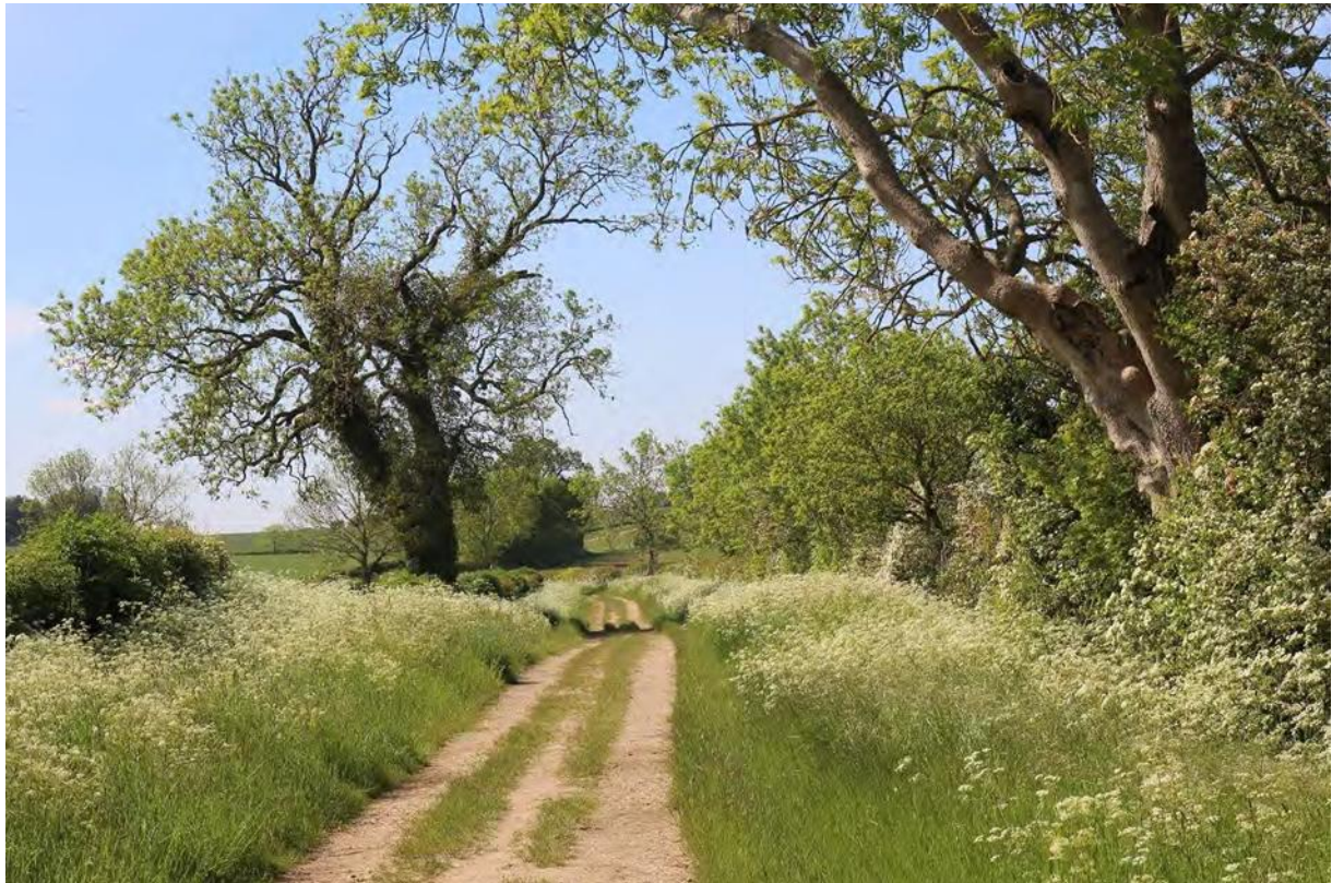
Figure 3. The “Track” during summer. The way the land rises to the north is clearly visible from the photograph. These hills will be covered in solar arrays if the project is approved.

This footpath is the most used by residents of the village of Cassington and was an essential community asset during the Covid lockdown, essential for exercise and the mental health of the villagers. The footpath rises to the north of the village providing panoramic views at the top of the village, the village church, Wytham Wood and as far as the city of Oxford itself. Views mainly to the west and particularly the east will be lost as a result of the proposed development, in early stages as a result of the presence of solar arrays and in later stages as a result of the proposed mitigation in the shape of hedging. Noise will be a major issue during pile driving and construction of this part of the central section of the development. Overall, there will be considerable loss of amenity and the historic setting of the ancient village of Cassington and its 900 year old Grade 1 listed church and surrounding conservation area.