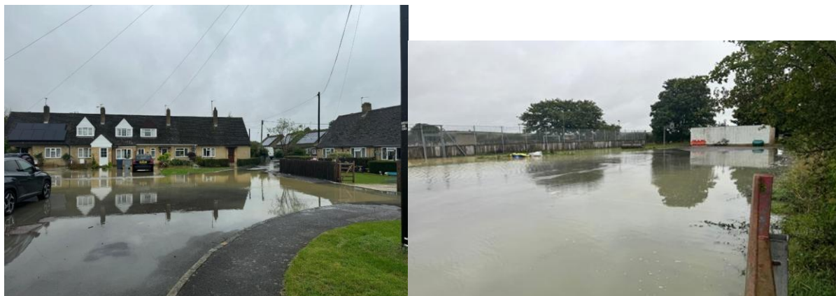
Figure 1 A/B Flooding on Elms Road and the Playing Field car park September, 2024. Four properties were flooded on Elms Road in this event, a repeat of flooding in 2007.