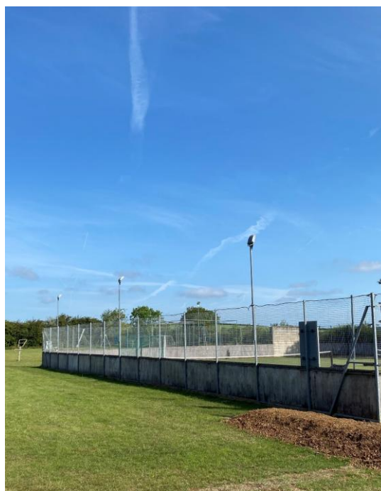
Figure 2. The astroturf pitch at Cassington Playing Field

The playing field offers open views across the surrounding landscape, which are highly valued by the local community. There is wide-ranging concern that the proposed solar development would significantly alter these views, encroach on a valued community asset and affect the recreational and visual amenity of the area especially in winter. An on-site inspection would provide necessary context to assess the degree of visual intrusion that may result from the proposal. It will also provide the opportunity to view the boundaries of properties along the Yarnton Road that will be within 25m of the edge of the proposed development.